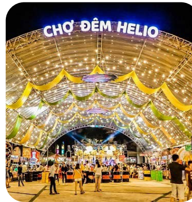
Night Market Exploration