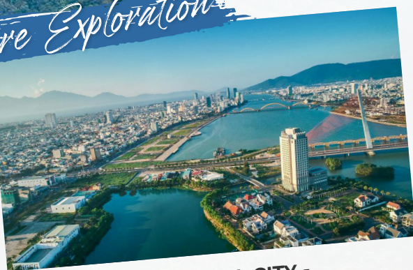
THE VIBRANT COASTAL CITY - SUMMER PARADISE DANANG CITY