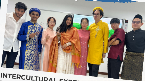
INTERCULTURAL EXPERIENCES & PERSONAL DEVELOPMENT