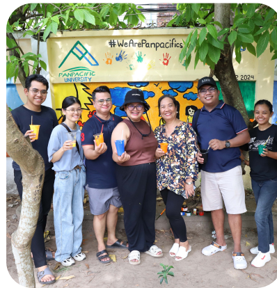
Community Service Activities