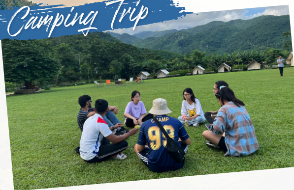
PEER CONNECTION & NATURE APPRECIATION